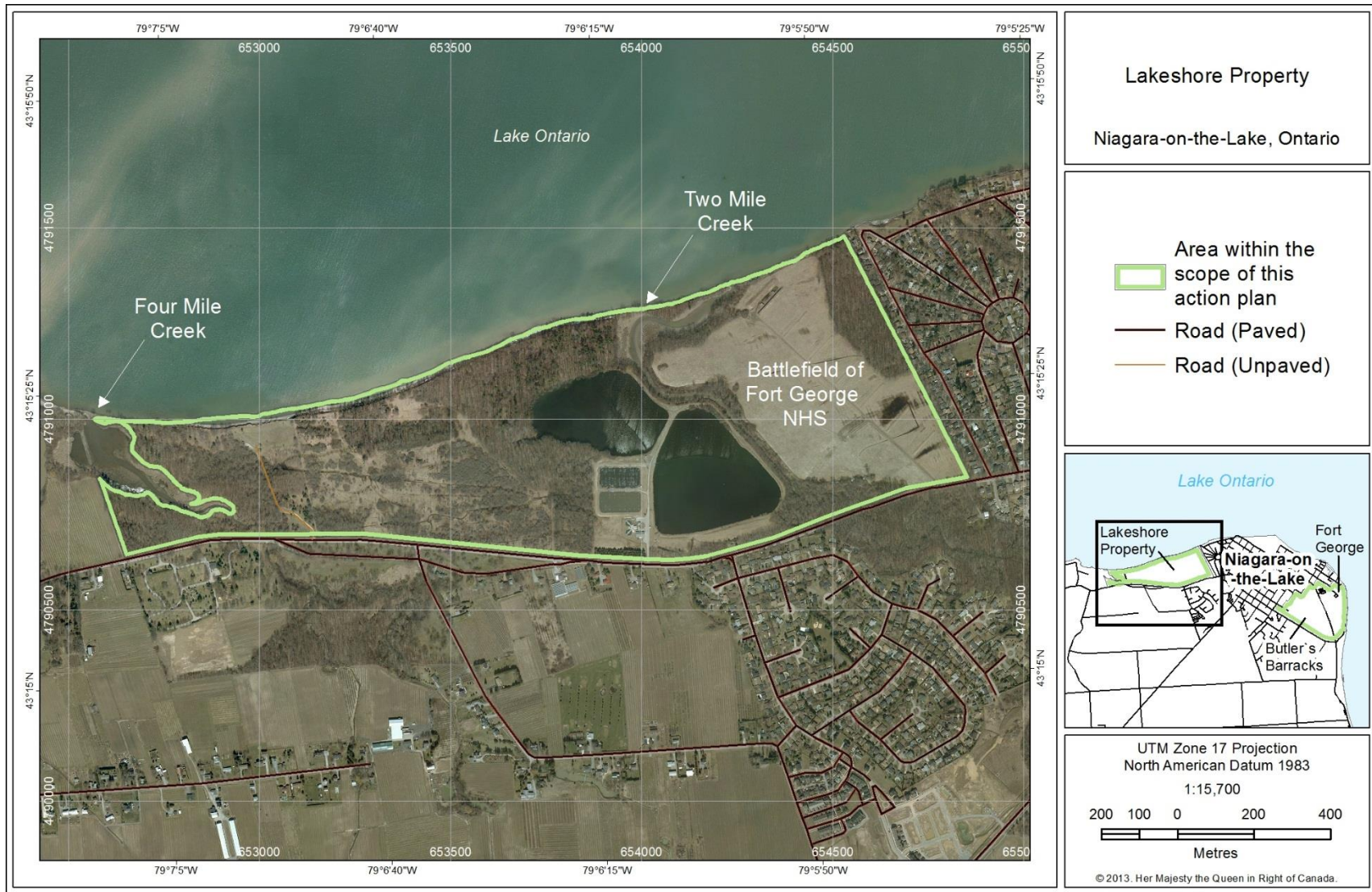
Figure 2. The Lakeshore Property included in the scope of this action plan that includes the Battlefield of Fort George National Historic Site.