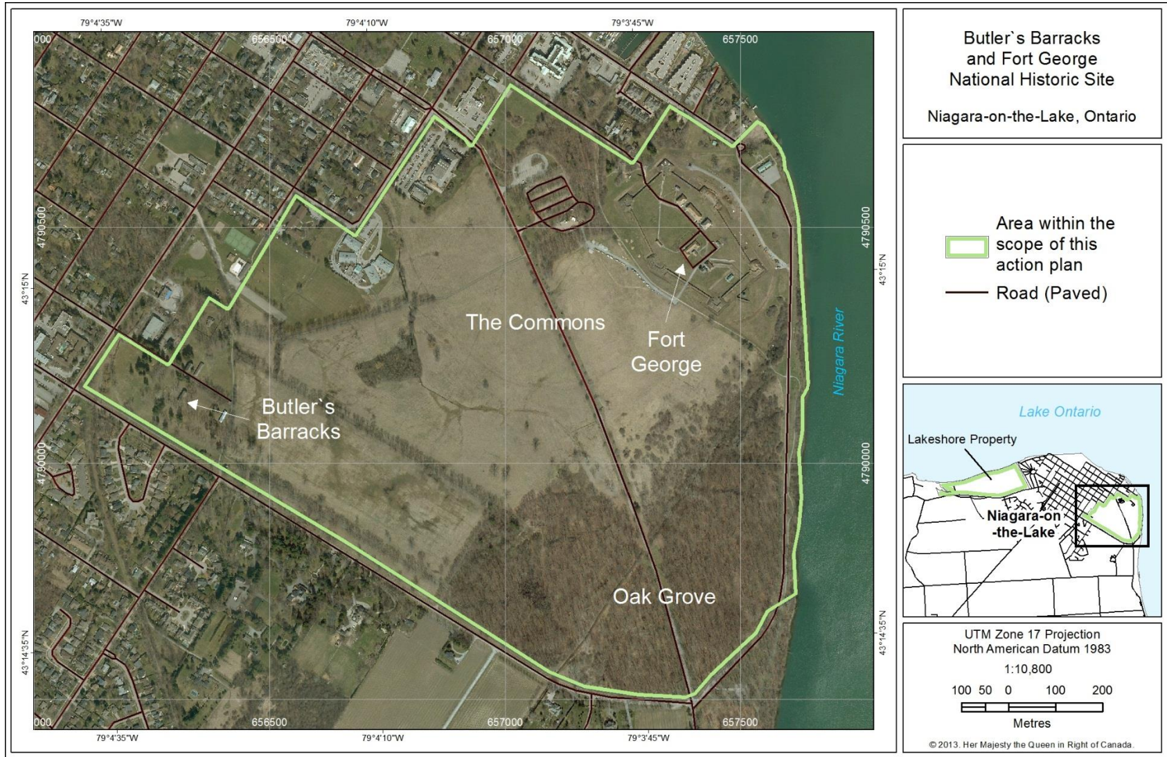
Figure 3. Fort George National Historic Site and Butler's Barracks National Historic sites included in the scope of this action plan.