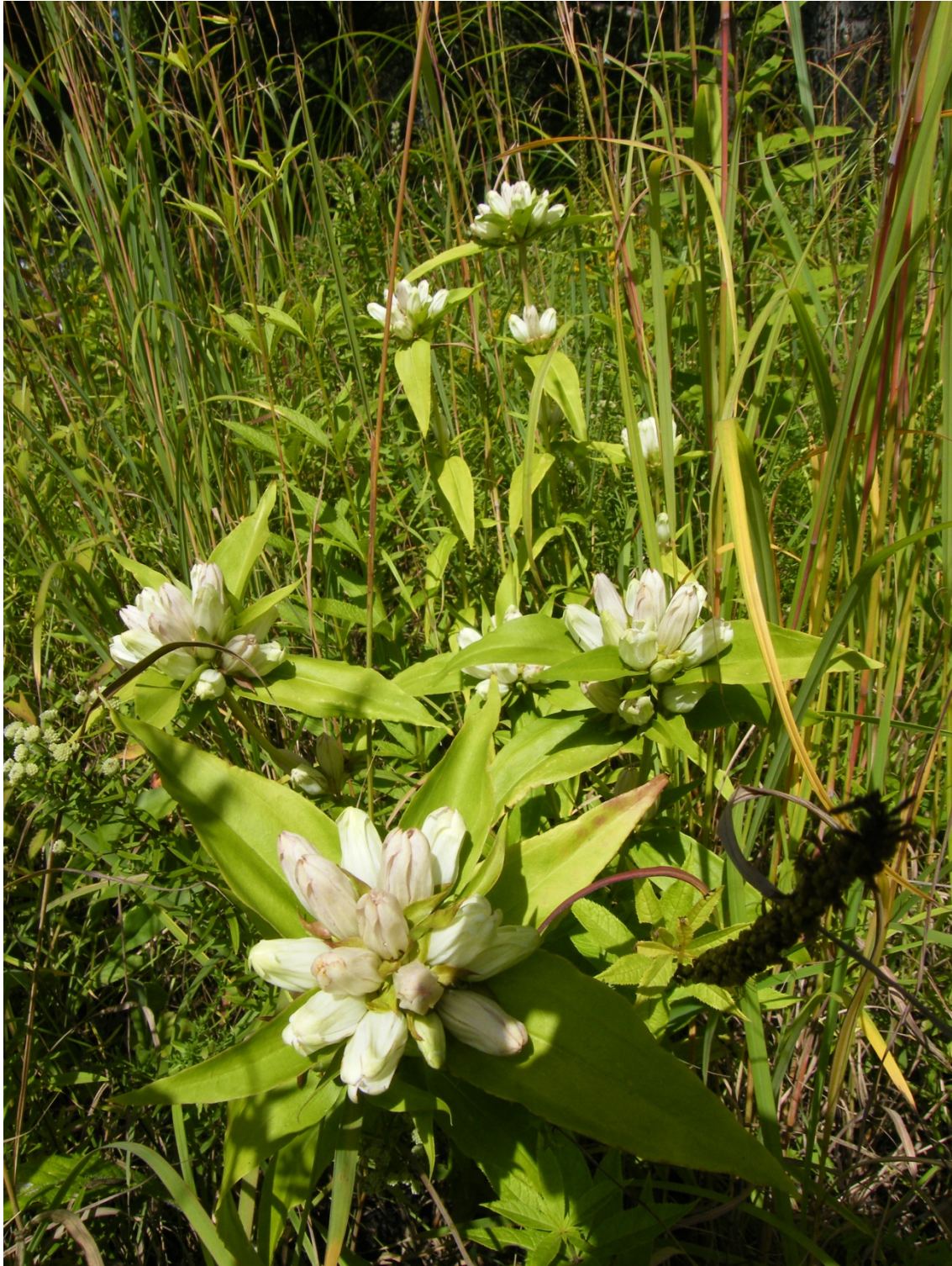
Figure 1. Gentiana alba at WIFN showing the growth form and details of the inflorescence.