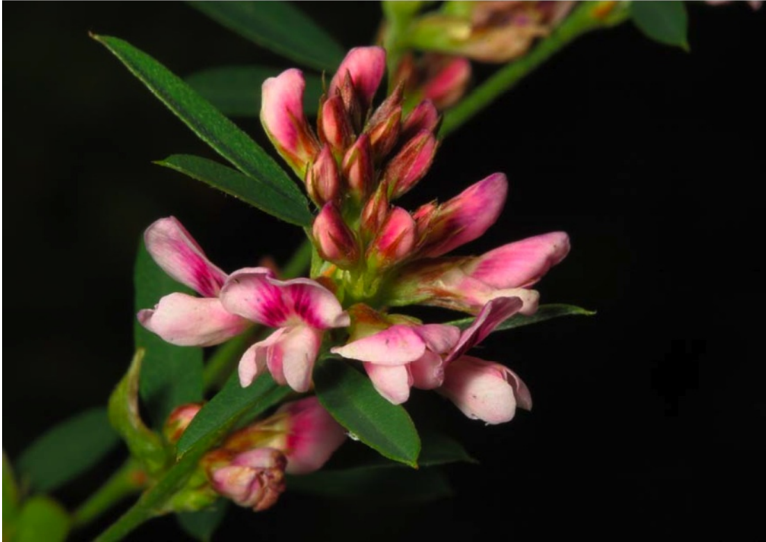
Figure 1. Flowering clusters of Slender Bush-clover showing both the showy and the non-opening flowers. (Photo: P.A. Woodliffe. This photo may not be reproduced separately from this document without permission of the photographer.)